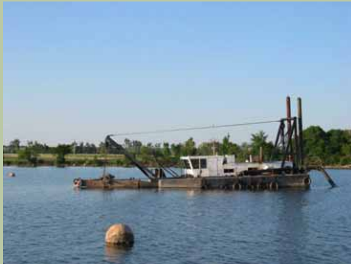
Sediment removal by dredging machine